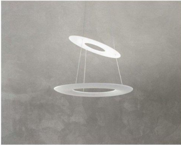
Available Versions Erhältliche Ausführungen